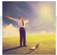
Hosting & Housing