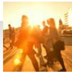
eGov & B4B