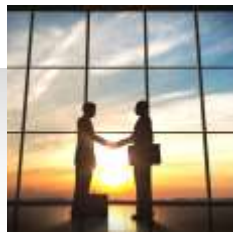
Capital Markets & Treasury