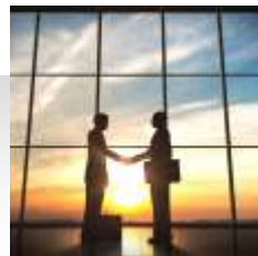
Capital Markets & Treasury