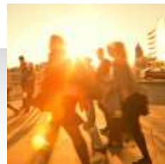
eGov & B4B