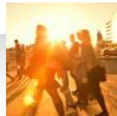
eGov & B4B