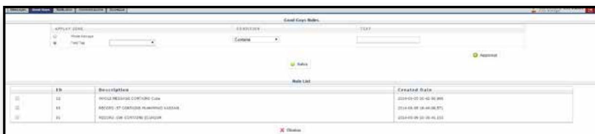
False Positives Management Interface